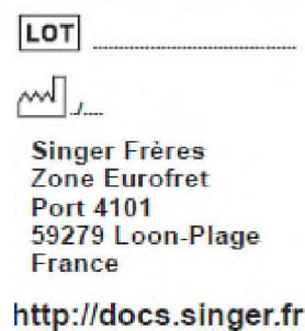
Reference standard :